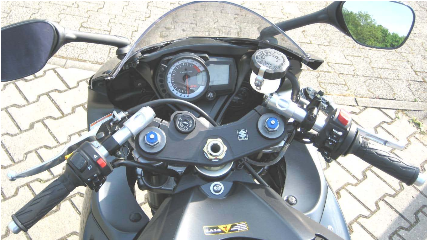
Mounted conversion kit